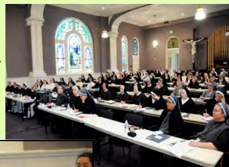
Above: More than 90 sisters attended the workshop, hosted by the Dominican Sisters of St. Cecilia in Nashville, TN. ■