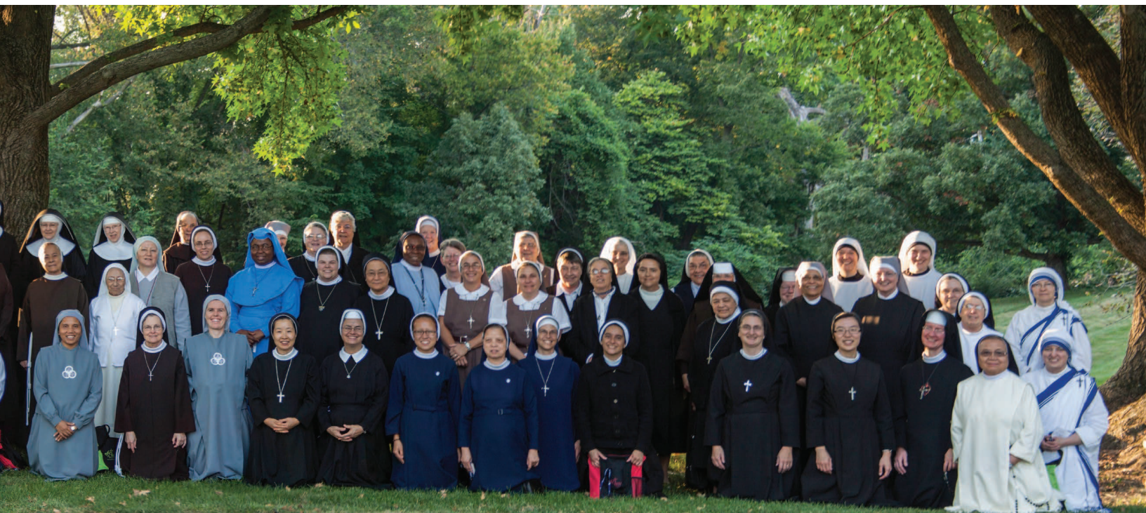
ady of the Snows in Belleville, Illinois