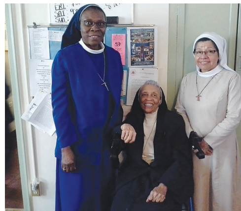
FHM Centennial: A few sisters stop for a photo at one of their centennial celebrations.

Sisters teach and provide pastoral care, social services, parish ministry, and altar bread distribution to parishes in the Archdiocese of New York and serve in preventative health missions in rural Africa, the Caribbean, and the U.S. The sisters are joyously reflecting on one hundred years of providing vital assistance to the community and Church with unwavering faith and steadfast love, and they strive to revitalize their purpose and expand their missions of service for the next 100 years.