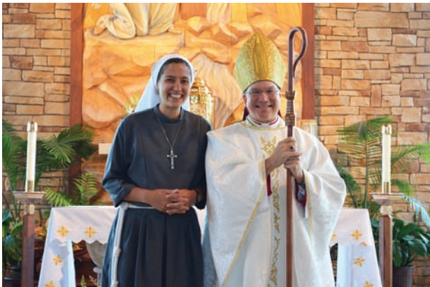
Franciscan Sisters T.O.R. of Penance of the Sorrowful Mother, Steubenville, OH Profession of First Vows