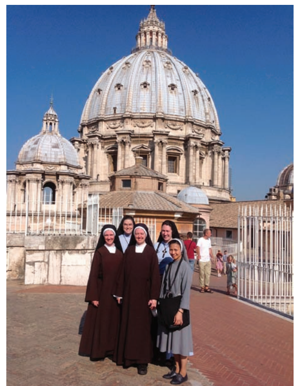
A small group went to the top of St. Peter's Basilica. We are on the top of the façade (at the level of the Statues of the Apostles). We took an elevator to the top of the façade and then walked the 300+ steps to the top of the Cupola.