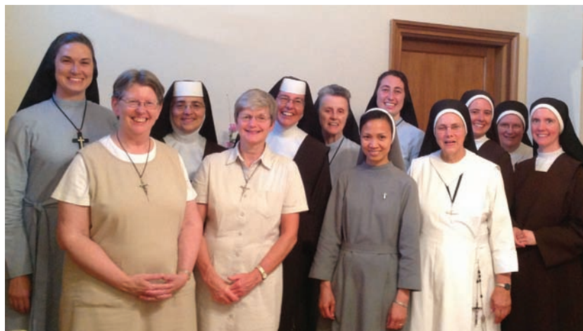
CMSWR Communities participating: Congregation of Mary, Queen - American Region, Carmelite Sisters of the Divine Heart of Jesus, Sisters of Charity of Our Lady Mother of the Church, Carmelite Sisters of the Most Sacred Heart of Los Angeles, Servants of God's Love and Religious Sisters of Mercy of Alma, Michigan

The program was fittingly termed a pilot program for a time of renewal. Having spent three weeks together in the heart of the Church in Rome, each Sister returned to her community and apostolic assignment with an interior freshness and readiness to share the love and joy of Jesus Christ.