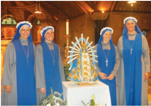
Institute of the Servants of the Lord and the Virgin of Matara, Immaculate Conception Province, USA Profession of Final Vows