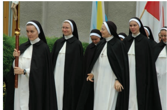
Dominican Sisters of the Immaculate Conception, Justice, IL Profession of Final Vows