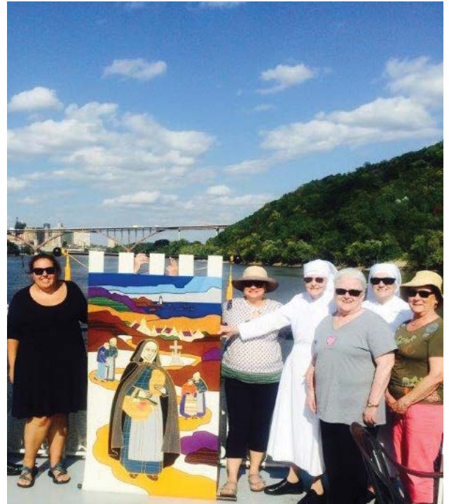
The Little Sisters of the Poor in Saint Paul, Minnesota celebrated the 150 years of foundation by taking a banner of Saint Jeanne Jugan down the Mississippi River to 'Pig's Eye', later renamed Saint Paul, the place marking their arrival in to serve the good people in Minnesota.

This year marks a special 150 th Anniversary of our first Little Sisters who arrived on American soil. Looking to the future, we have chosen to use the sesquicentennial as time for reflection and